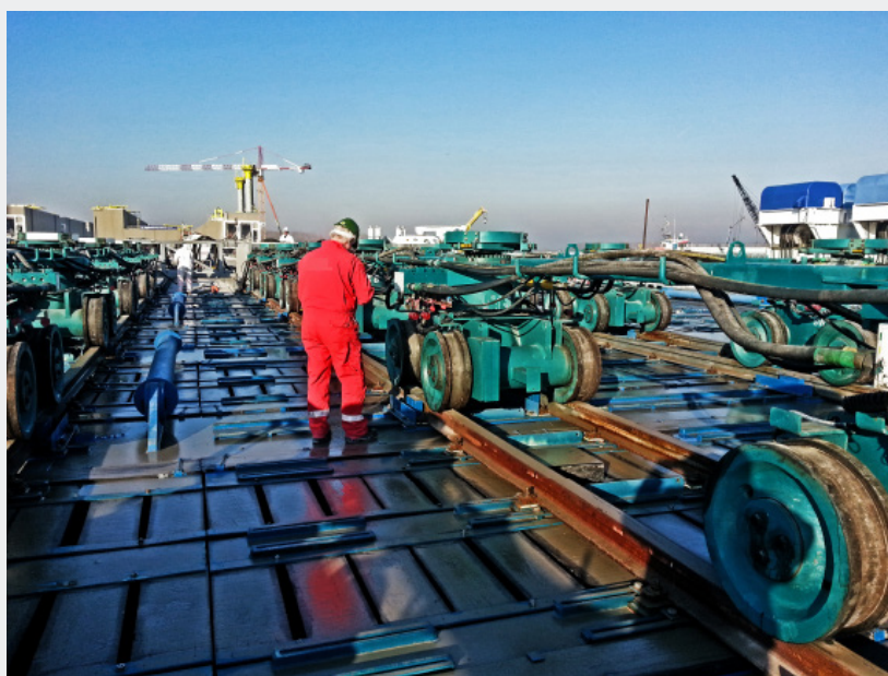
Inspections of Syncrolift equipment

Our worldwide-dedicated service network of trained engineers are there to support your needs.