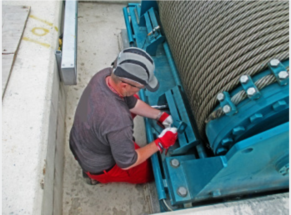
Montage of Syncrolift parts

Syncrolift® offers remote technical support on demand. Users can activate a remote connection through the PLC communications module and/or directly on the Syncrolift® PC. By remotely connecting to the system, we can provide system diagnostics, remote fault-finding, system monitoring, and operator support. We can also upgrade existing systems with remote features if this is not already enabled/available on your system.